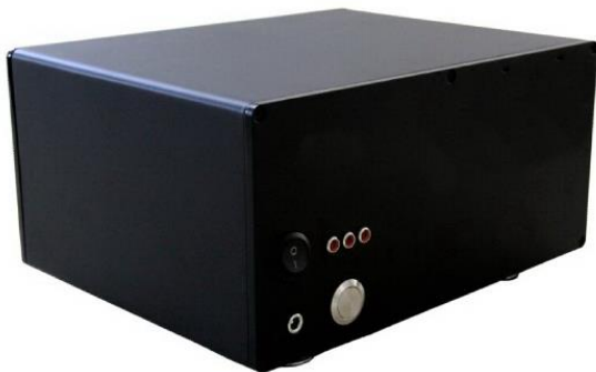
Figure2—Host Back View