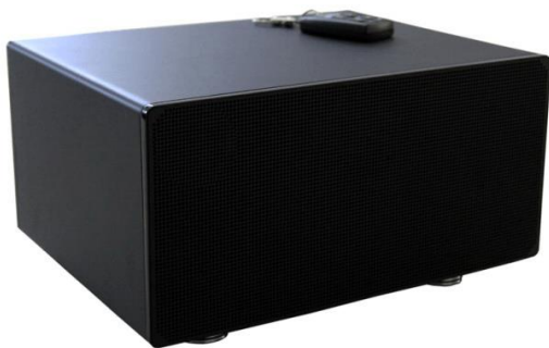
Figure1—Host Front View

The Jammer Host and related accessories as shown below: :